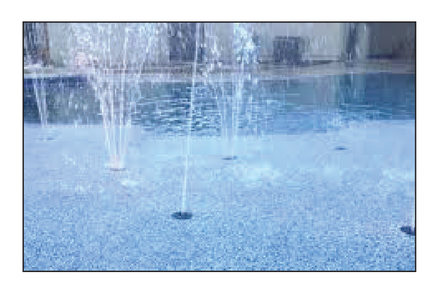
Chehalem Park and Recreation District 125 S. Elliott Road Newberg, Oregon 97132 cprdnewberg.org Visit us on Facebook