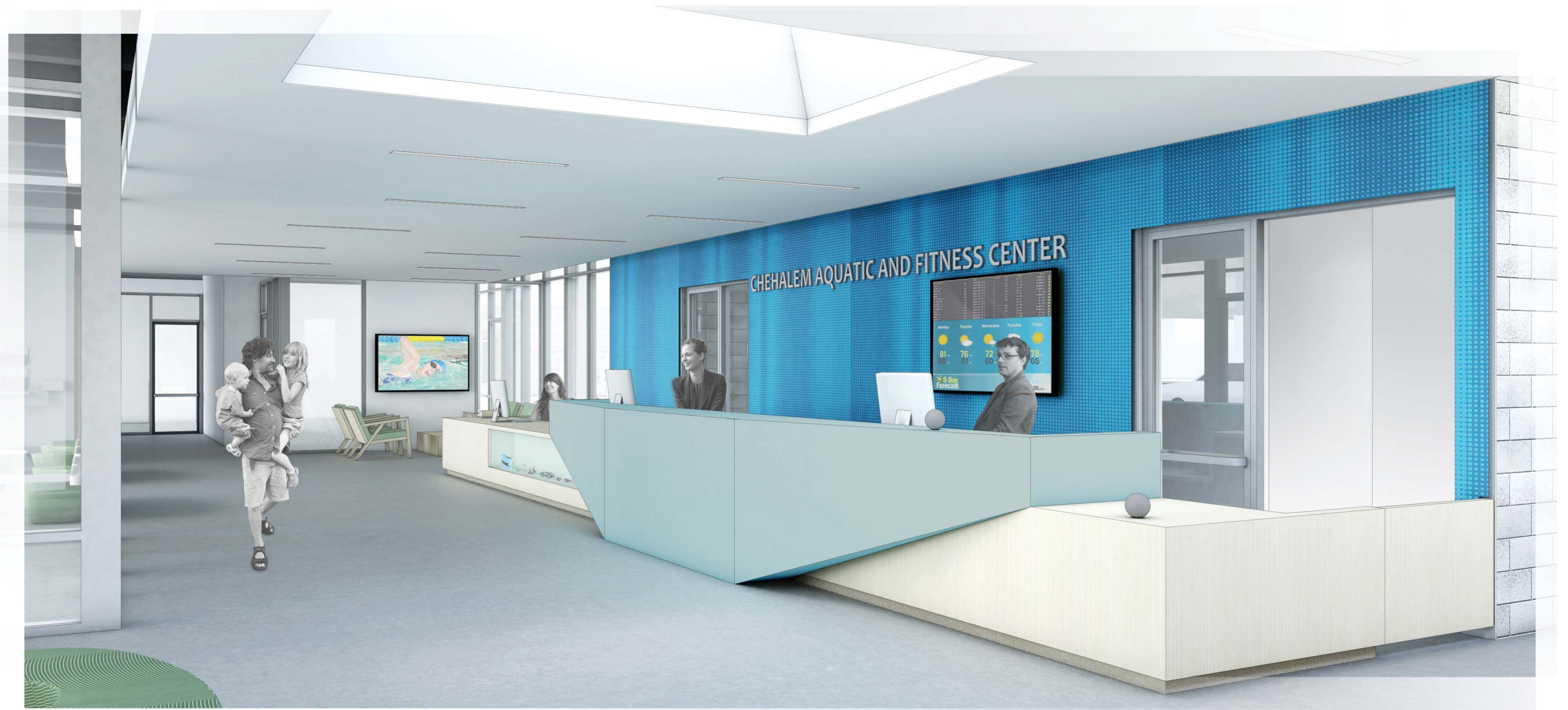
LOBBY RENDERING 2