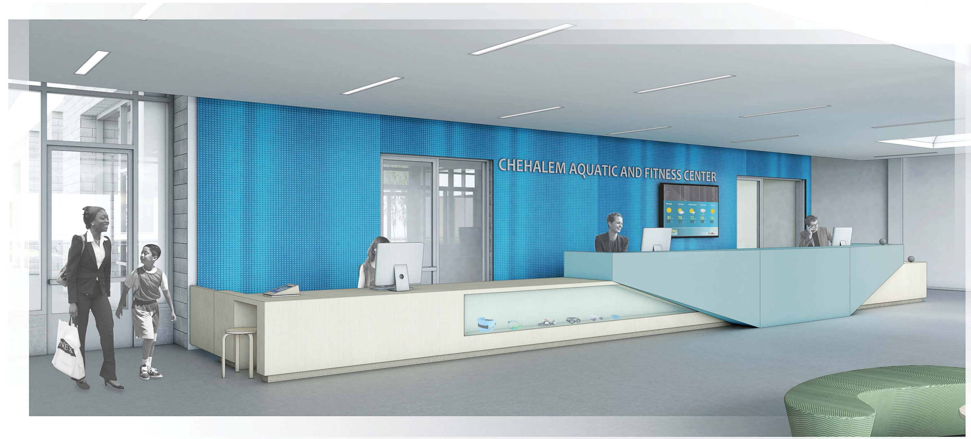
LOBBY RENDERING 1