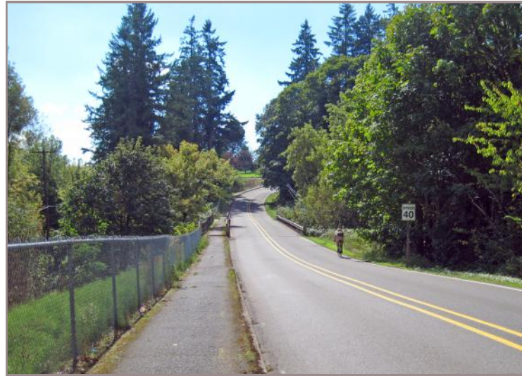
Cyclist crossing Chehalem Creek Bridge on Dayton Avenue

Vigil-Agrimis Design Professionals Tel (503) 274-2010