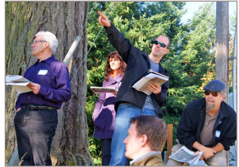
Advisory Committee members studying trail alignment