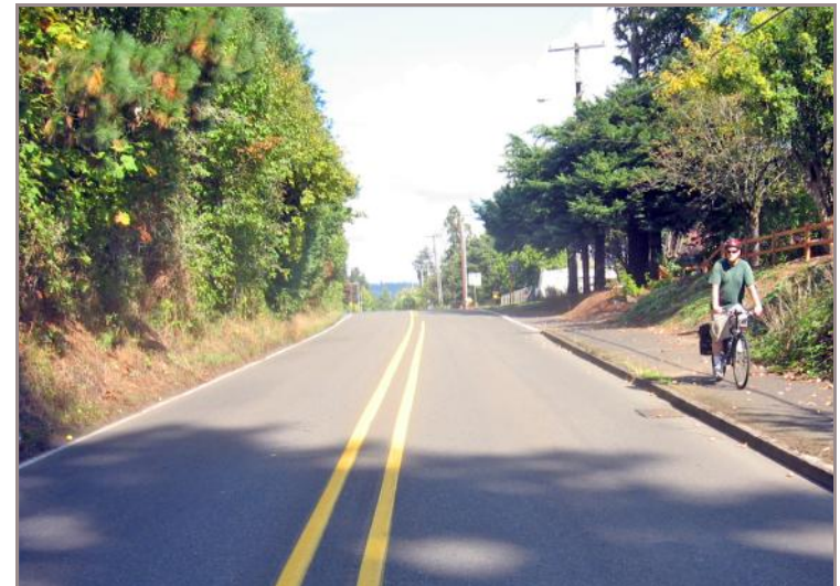
Existing multi-use trail along Dayton Avenue

CPRD began the Phase 1 Master Plan for the Newberg-Dundee Connector in August 2010. This effort is focused on