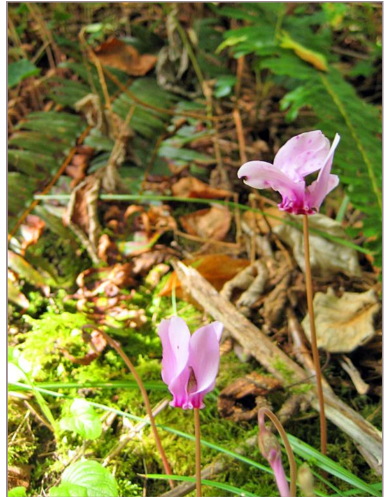
Hess Creek Canyon Botanical Garden at George Fox University